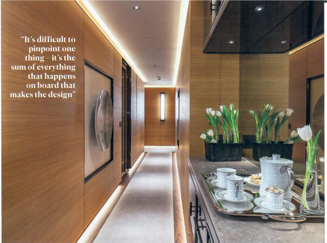
Above: the main wood is natural oak with a dark walnut trim, and Dedar fabric for art niches. Guest cabins (below) have large windows and wall fabrics by Métaphores or Pierre Frey

"It's difficult to pinpoint one thing – it's the sum of everything that happens on board that makes the design"