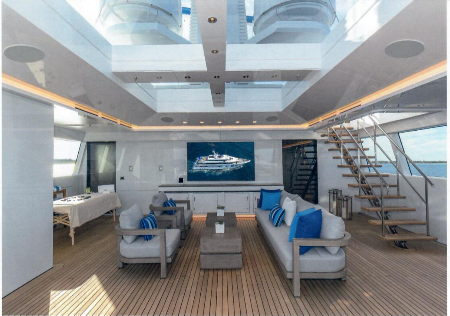
Above and below: the outdoor lounge on the owner's deck features furniture in weathered teak from RH's Portofino Collection