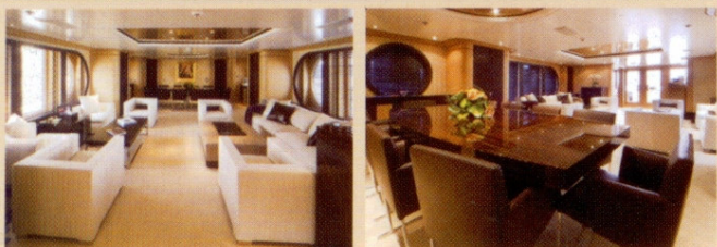
164' AMELS 2001/06 "MALIBU"*