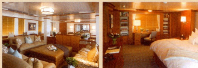
164' HAKVOORT 2006 "JEMASA"*

*Not for sale or charter to US residents while in US waters.