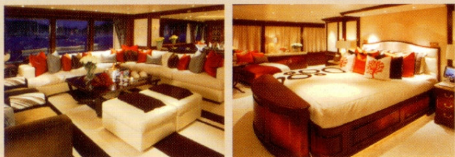
204' FEADSHIP 2000/07 "FORTUNATO"*