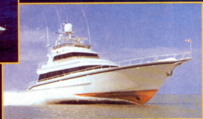
102' - 46 KNOTS, SPORT FISHING YACHT