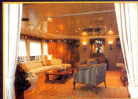
INTERIOR LADY MARINA