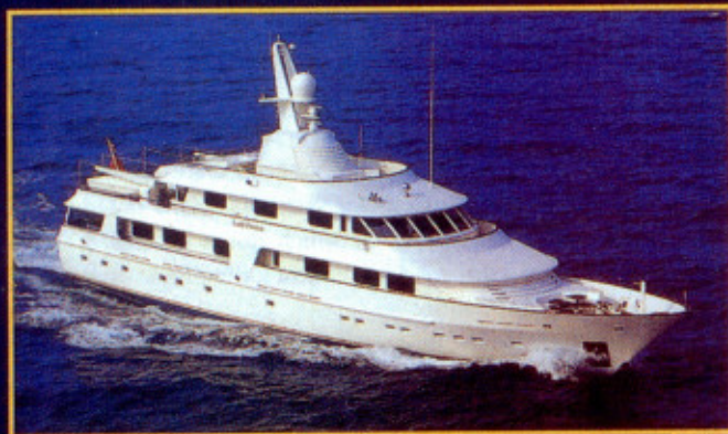
LADY DUVERA. DELIVERED 1991