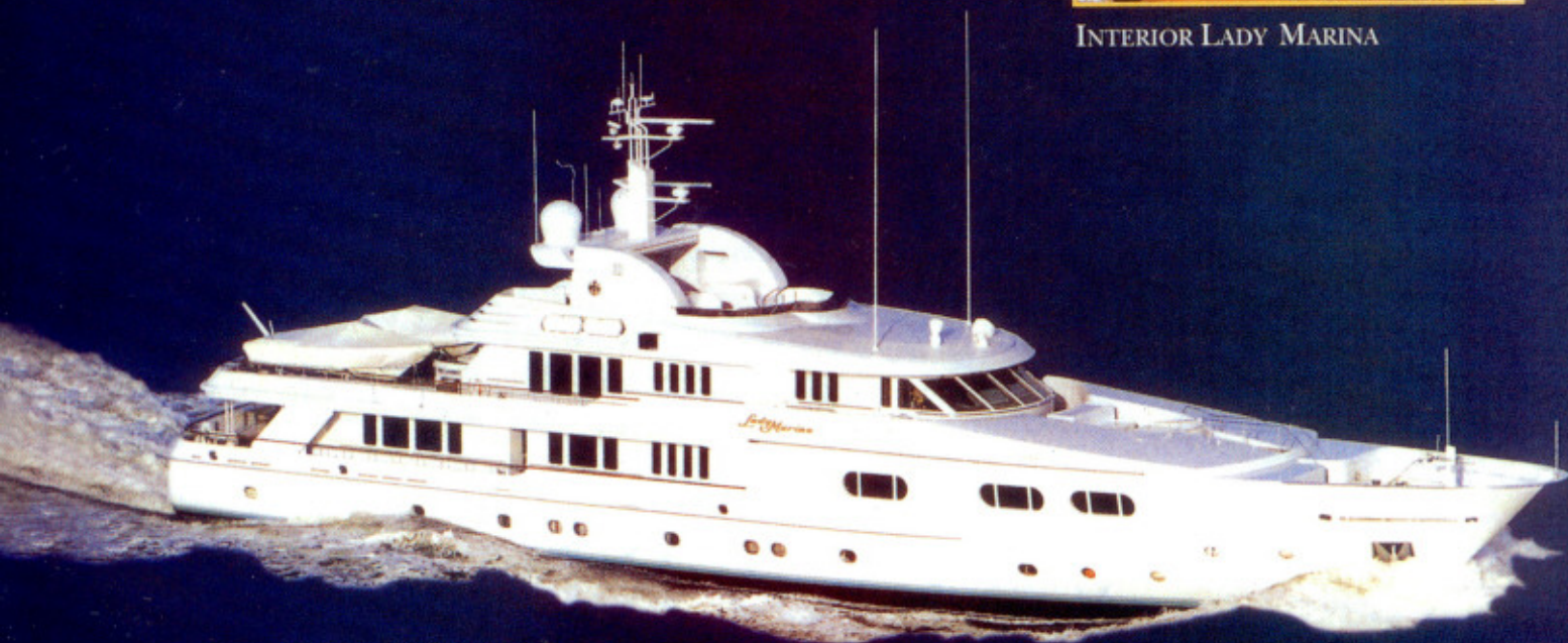
LADY MARINA. 50 METER