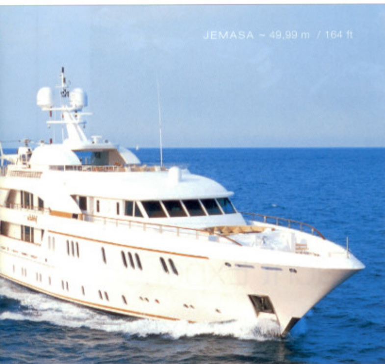
JEMASA ~ 49,99 m / 164 ft