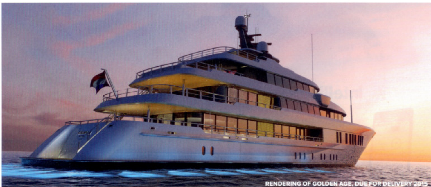
RENDERING OF GOLDEN AGE, DUE FOR DELIVERY 2015