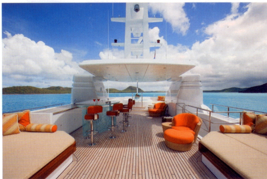
The 125' yacht welcomes up to 10 guests and eight crewmembers and offers large aft deck dining and recreations areas