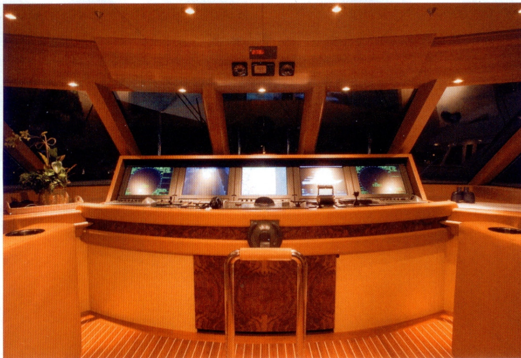
The perfectly equipped bridge console matches the yacht's understated elegance