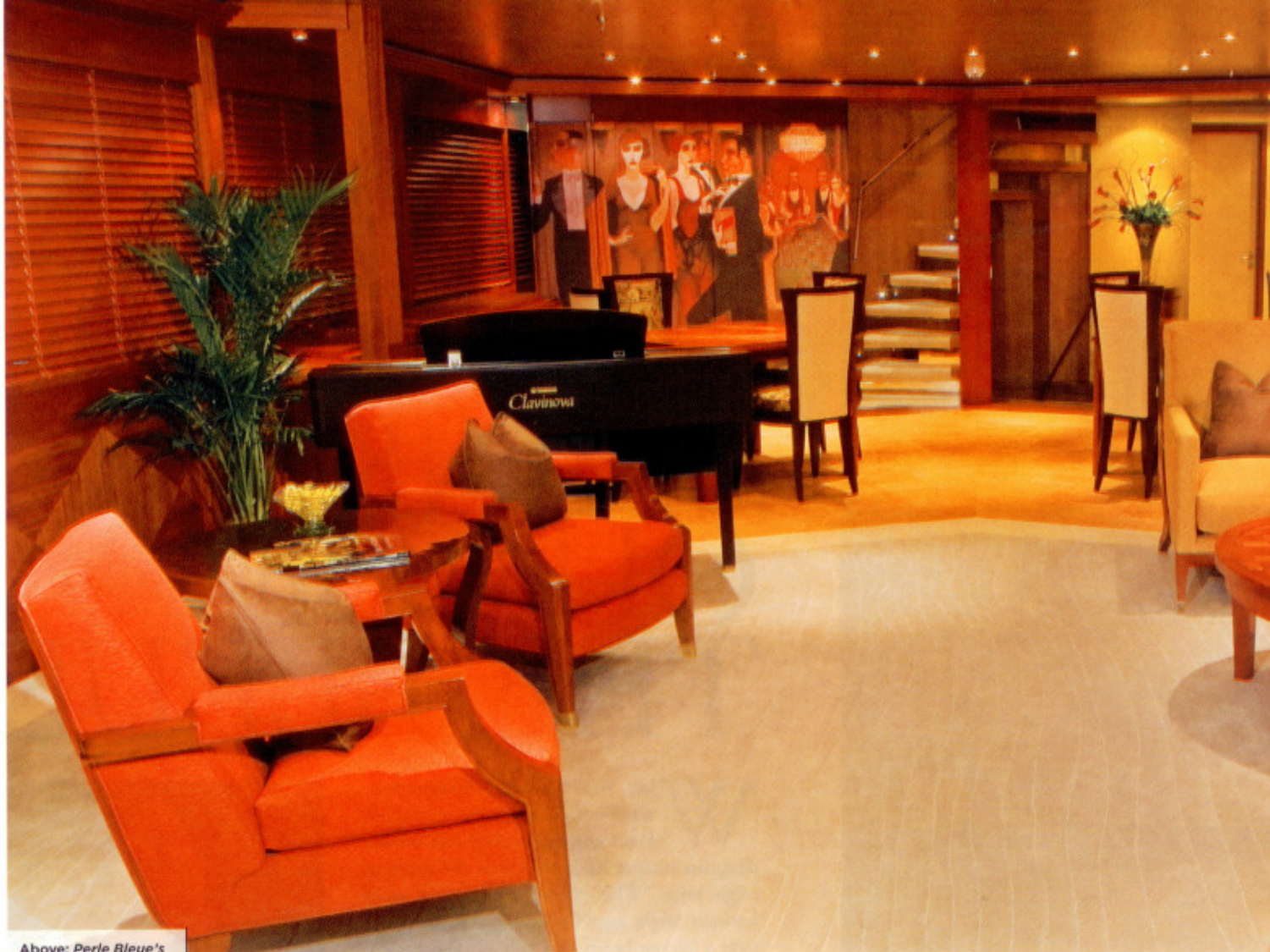
Above: Perle Bleue's

French Moderne interior departs from the contemporary and traditional motifs found in the Beys' previous yachts. Right: A medley of stones achieves a peaceful space in the master bath. Bottom right: The compact master suite is supremely stylish.