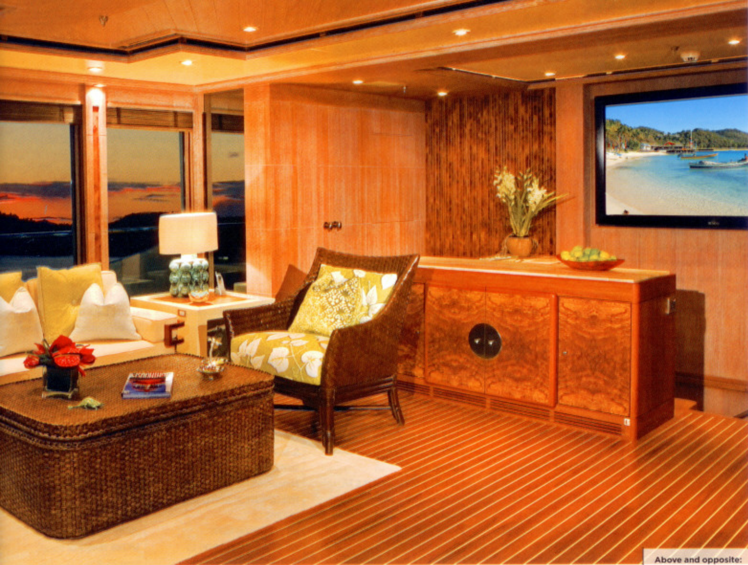
Above and opposite:

Floor-to-ceiling glass provides clear views from the skylounge.