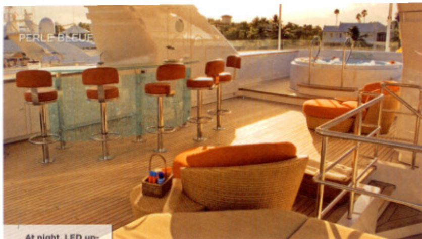
At night, LED up-lights illuminate the cracked-glass bar located to port on the sun deck.

skylounge and aft deck. It dips down even farther aft for wave-watching. Hakvoort also pinned the glass from the inside of each stanchion rather than using the common metal plates that usually secure such glass panels.